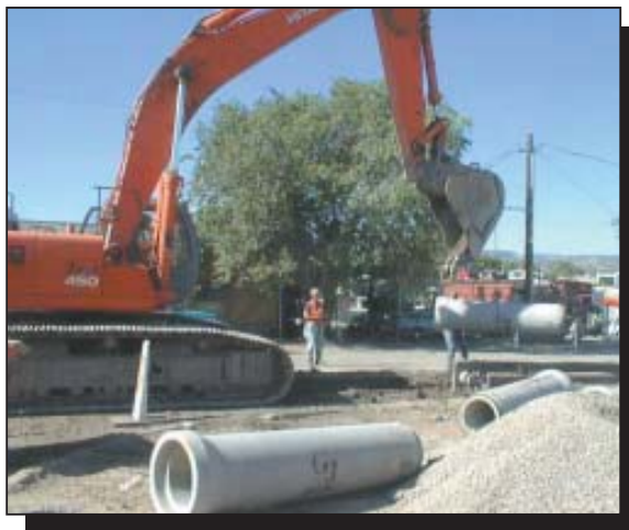
Mendez Construction of Grand Junction is installing new storm drains on Noland Ave east of 5th Street as part of the City's Combined Sewer Elimination Project.

The City owns or has part ownership in 17 reservoirs on top of Grand Mesa, providing 5,300 acre feet of water. This is the first time since 1998 that all the reservoirs have completely filled, although they were close to filling in year 2000.